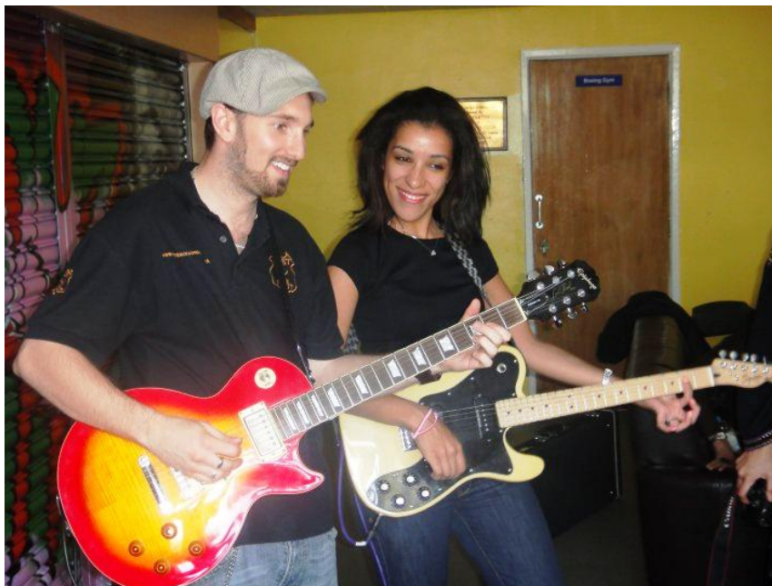
Bahraini delegate at Coventry Boys Club