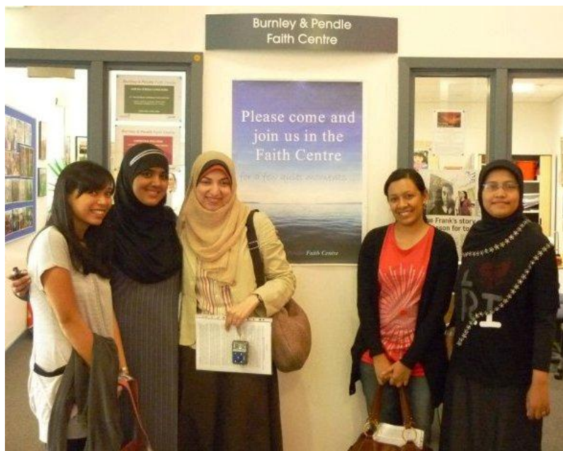
Delegates at the Burnley & Pendle Faith Centre

The second week of the Summit was a chance for the participants to see community leadership in action and contextualise the topics that had been discussed in the first week. Delegates divided into four groups and dispersed to London, Birmingham, Manchester and Bradford to visit community projects which demonstrated how local social and sustainability issues were being addressed by all manner of different organisations. At each destination the delegates were welcomed by the local members of the Mosaic Network. The delegates appreciated this hospitality and the chance to meet with the volunteers who are integral to Mosaic's work in the UK.