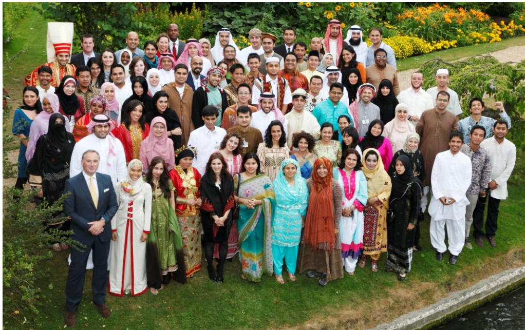
Mosaic International Summit 2010 delegates at Clare College, Cambridge

Mosaic was set up by HRH The Prince of Wales in 2007 with the aim of creating opportunities for young people – championed by Muslims and harnessing the power of positive thinking. Building on the highly successful and expanding UK network, the leadership programme is part of Mosaic International's wider work which aims to create opportunities for young people of all backgrounds and to increase understanding between different people and groups. Alumni of the leadership programme become part of Mosaic's influential worldwide network of individuals who are committed to taking action in their local communities.