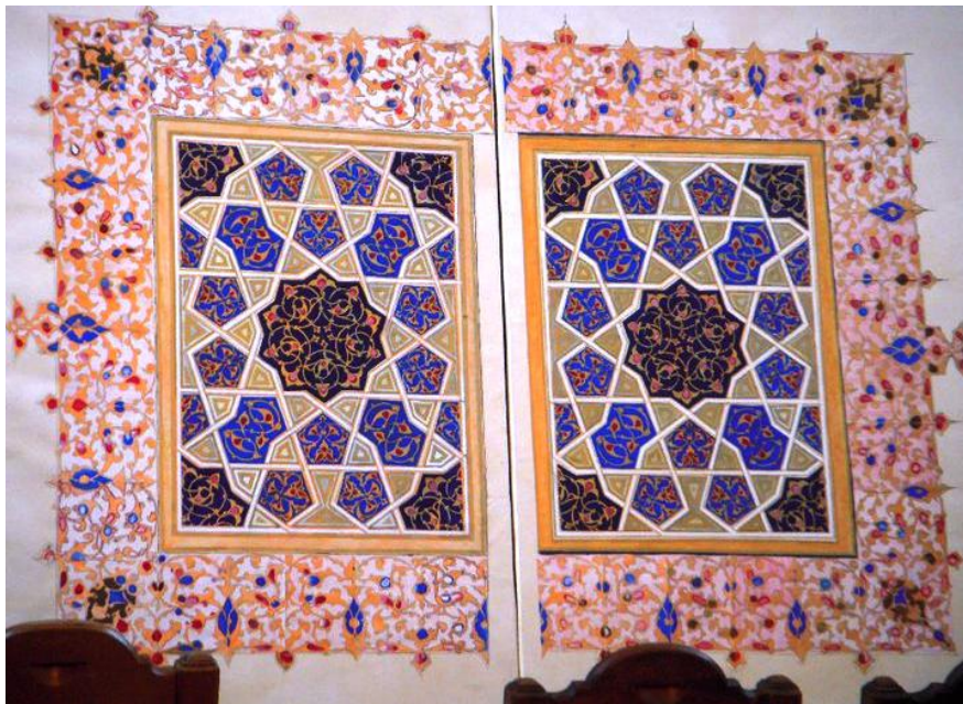
Mosaic artwork created by the delegates of the 2010 International Summit

Federation of Pakistan Chambers of Commerce and Industry. The unique range of nationalities meant that participants were mixing and working with people who they would never meet under usual circumstances. It served to broaden the outlook of the Summit and to challenge preconceptions. This enabled the delegates to learn firsthand what the key social, economic and environmental issues are in a wide variety of countries and to apply this knowledge where appropriate to their own communities. All participants were aged between 25 and 35 and are emerging leaders in their fields. Delegates were able to bring knowledge to discussions from areas as diverse as digital art, neuroscience, agriculture, media, engineering and disaster management to name a few. This diversity of experience which was brought together by the Summit was represented in a piece of artwork that was created by all of the delegates at the end of the first day of the Summit. The Prince's School of Traditional Arts facilitated the creation of a mosaic which poignantly demonstrated the importance of teamwork and that the whole is greater than the sum of its parts.