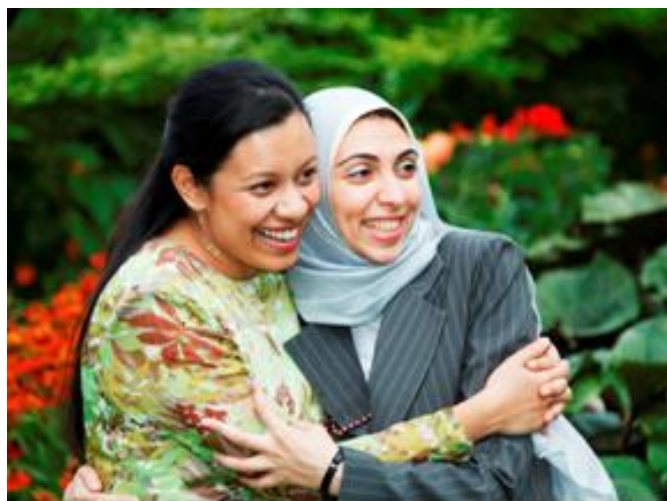
Strong friendships transcending borders

Another example is of an Indonesian delegate who felt moved to do something to raise the number of people going into higher education in Indonesia, which is currently at less than 10%. With a group of her friends she is establishing a service to provide advice to young people thinking about going on to higher education. With a particular focus on helping those who come from disadvantaged backgrounds to gain scholarships, she hopes to contribute towards an increase in the percentage of young Indonesians going to college.