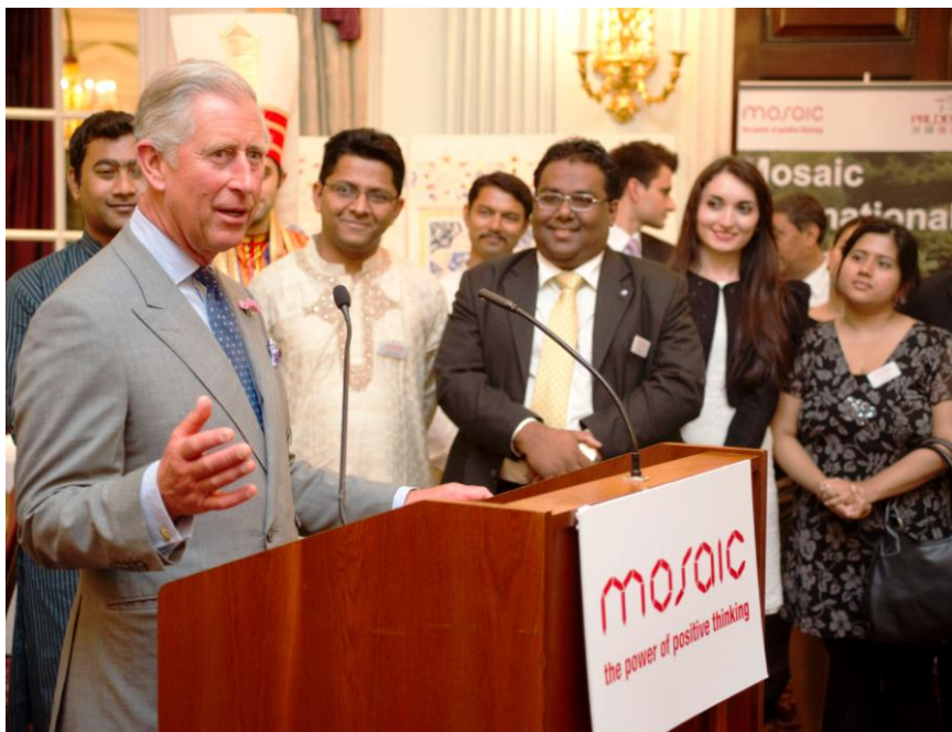
HRH The Prince of Wales addressing guests at the Mosaic International Summit